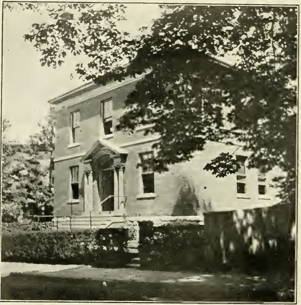
LIBRARY OF THE NEWPORT HISTORICAL SOCIETY ERECTED 1902